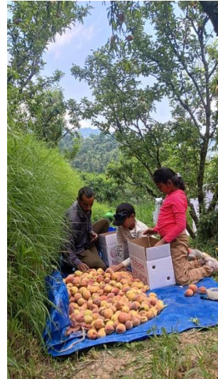
The Fruit Collection