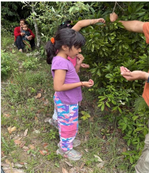
In the Wild