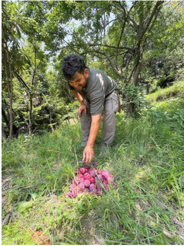
Fresh from the Tree

Last year's guests, this year's memories waiting to be made.