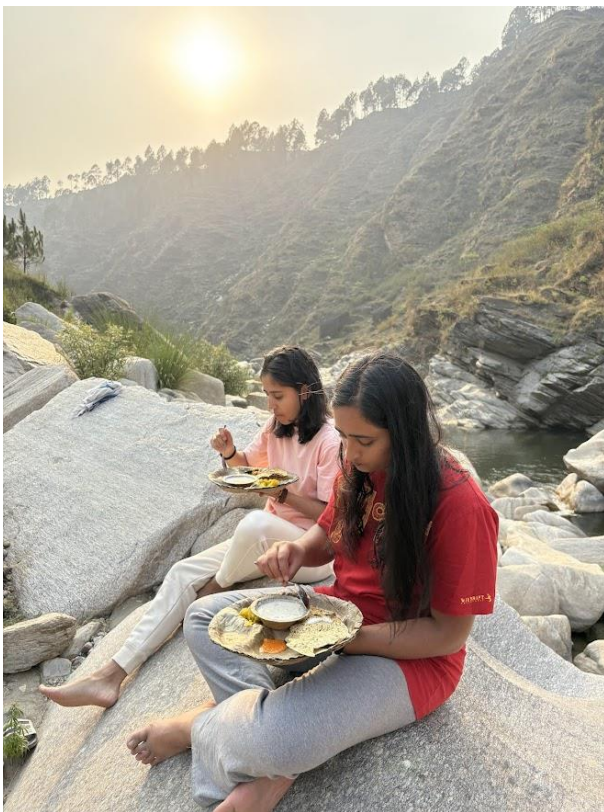
Lunch at Riverside